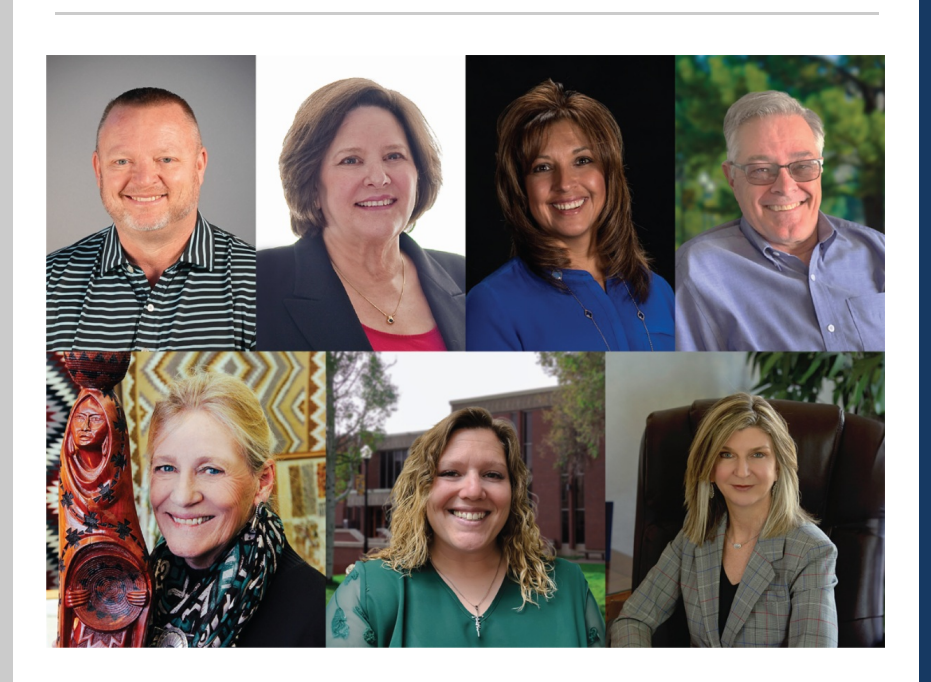
Board Reflections On "Giving Done Well"

In an exhilarating display of grit and determination, your Trinidad State Trojans celebrated a historic achievement last fall—the College's first ever Men's Cross Country NJCAA National Championship. Read More