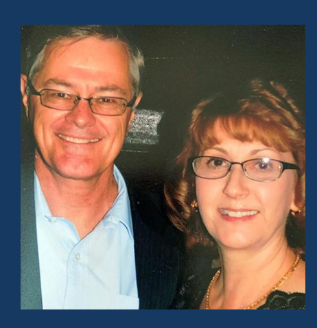
"We all pay month-by-month

Links to these and other informational articles are shared as a courtesy with members of the Trinidad State community. Trinidad State in no way endorses any specific company, organization or strategy. Please consult with appropriate advisors, as necessary.