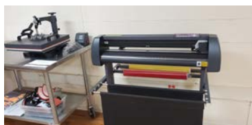
Heat Press and Vinyl Cutter

(Visit https://trinidadstate.edu/open/ for a list of participating programs)