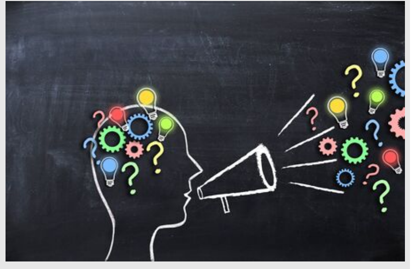
WANT TO SHARE YOUR KNOWLEDGE? TRINIDAD STATE IS THE PLACE FOR YOU!

Do you have knowledge, ideas or passions that you would like to share with others? Have a great idea for a class you'd like to teach? Consider teaching a non-credit community education class. Planning for future classes is always underway.